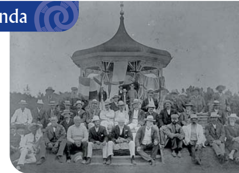
Band Rotunda - Rotorua Museum

It features cast-iron filigree work, a Victorian break-through that became widely used for constructing garden buildings and furniture. VIPs who came to town used the rotunda to deliver speeches: Prime Minister Richard Seddon once spoke here for an hour and a half!