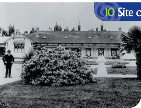
The Sanatorium - Rotorua Museum