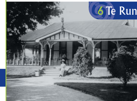
Te Runanga Tea House - Rotorua Museum

Te Runanga (the Meeting House) was built in 1903 as a tea pavilion and for many years served as a social centre for Rotorua. Here tourists and invalids could lounge, read and drink tea or mineral waters.