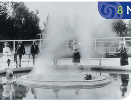
Malfroy Geysers - Rotorua Museum

The general name of this area is called Tawharakurupeti – the site of a great battle. About two hundred years ago Ngati Tuwharetoa warriors attacked Ohinemutu bent on revenge for past losses. The Rotorua army, led by the great chief Te Roro-o-te-rangi and his brothers Te Kata and Tunohopu, decided to make a stand in the area of Oruawhata. The opposing army far outnumbered the men who waited near here. Te Roro-o-te-rangi challenged his men in a rousing speech which has been passed on to his descendants as a whakatauki or proverb: "Ruia taitea, ruia taitea, kia tu ko ahau anake" - shake off the sapwood – retain the strong wood. The battle resulted in an overwhelming victory for the invaders and the deaths of Te Roro-o-te-rangi and Te Kata. Tunohopu battled his way to the lake edge with great courage and was allowed to live. The tekoteko on Te Runanga are a memorial to these three brave men.