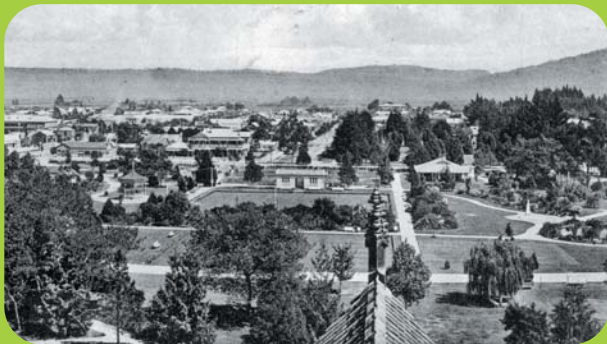
Rotorua Sanatorium Grounds c. 1908 - Rotorua Museum

Some geothermal features have been tamed, buildings have come and gone and pathways have changed, but the intrinsic charm and importance of this heritage site remains intact. Investigate the area's fascinating multi-layered history by following the trail on your map.