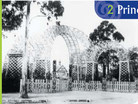
Prince's Gate Arches and Gateway prior to restoration - Rotorua Museum

The wooden arches that grace the entrance to the gardens once spanned the intersection of Fenton and Hinemoa Streets. Designed to represent the royal crown, they were erected in 1901 to honour the visit of the Duke and Duchess of Cornwall and York (later King George V and Queen Mary). After the visit, portions of the Prince's Gate were moved to their present position. The elegant totara gateway has been recently restored. Many of the original painted panels of the fence are in safe storage at the Rotorua Museum of Art and History.